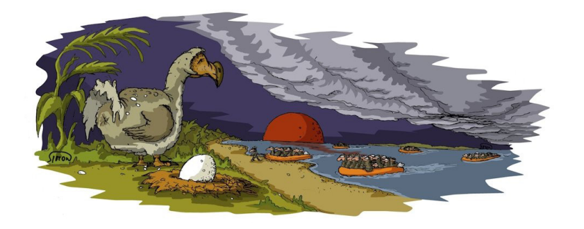
Picture 4: Winning caricature Uprchlíci a Evropané jako "Blbouni nejapní" by Marek Simon

Source: KLEMPÍŘ, D.: Evropané jako "blbouni nejapní". Česká karikatura roku reaguje na uprchlíky. Released on 12.03.2019. [online]. [2019-03-12]. Avalaible at: < https://www.blesk.cz/clanek/zpravy-kultura/359769/evropane-jako-blbouni-nejapni-ceska-karikatura-roku-reaguje-na-uprchliky.html>.