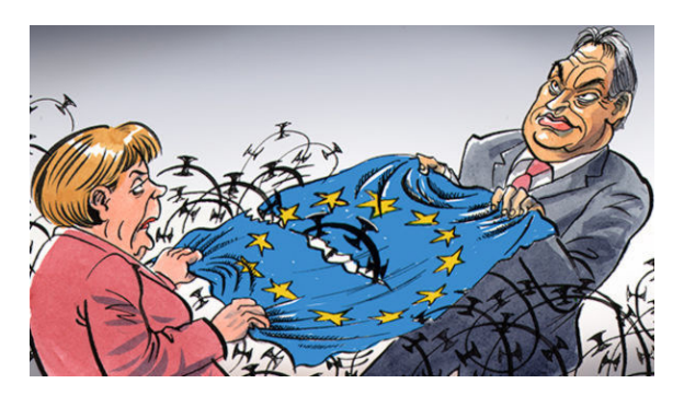
Picture 5: Caricature of the dispute between Viktor Orbán and Angela Merkel